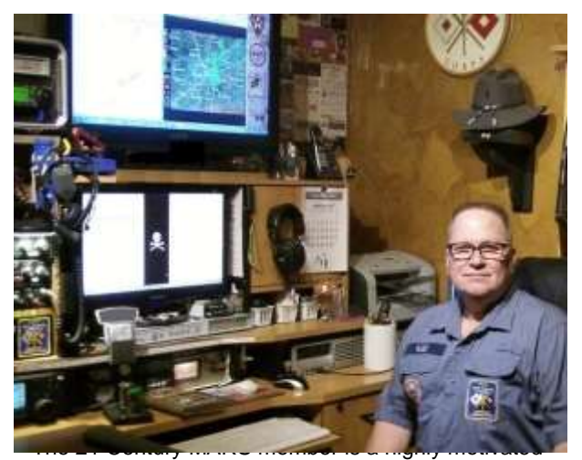
individual with key skills to support the United States.

Although an Amateur Radio license is required for AMARS membership, Amateur Radio experience alone is not sufficient to operate successfully in MARS. Individual member volunteers in AMARS are expected to take the initiative in expanding their existing foundation in electronics and radio communications