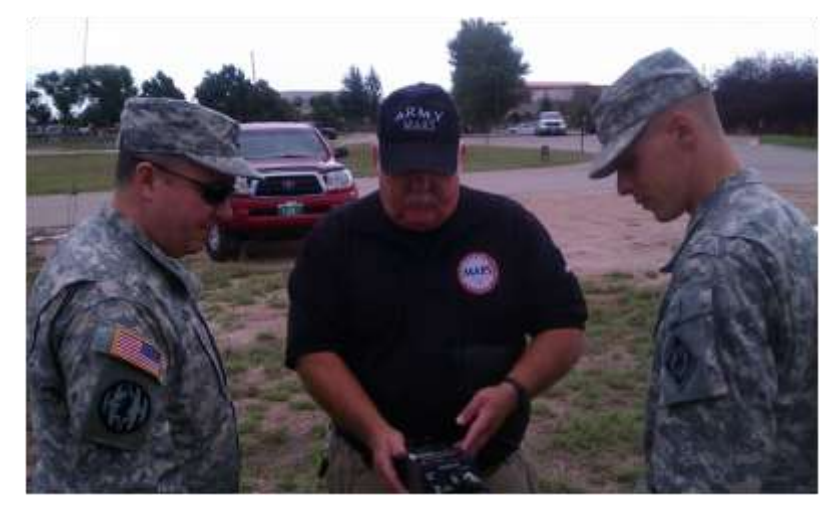
AMARS member demonstrating how to tune an antenna to WY Army National Guardsmen

Each respective MARS service provides an authorization to operate and assigns a military call sign to the individual's Amateur Radio station so it can operate as a military station. MARS operation is a federal military activity operating on assigned military spectrum authorized by